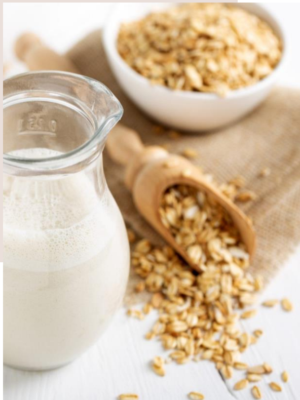
Source : -Oat- in Ingredient Factory, 2022

Emotion, product and attribute associations (Europe)